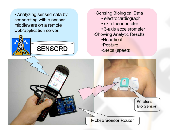
Figure 1: Healthcare services by using everyday mobile phones.

The system monitors user's physical conditions using an everyday mobile phone ^1 and a wireless biological sensor ^2 . To sense electrocardiograph correctly, it requires to be attached to user's chest by sticking electrodes of the sensor on tight with a peeloff sticker. Once it is attached to user's chest, it can detect the inclination and movement of the upper half of user's body by the 3-axis accelerometer.