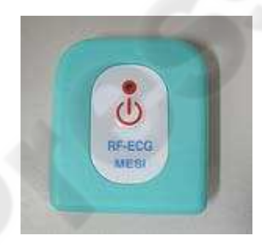
Figure 2: Wireless bio sensor.

The wireless biological sensor for sensing user's conditions is a small wearable sensor which integrates three kinds of built-in biological sensors: electrocardiograph, skin thermometer, and 3-axis accelerometer (see Figure 2).