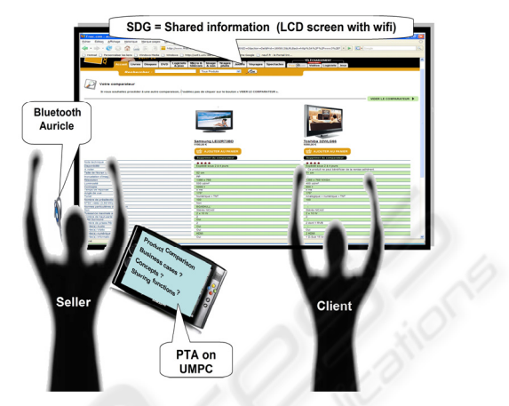
Figure 3: Example of SDG arrangement in the PTA scenario.

Session Agent keeps a state of the different channels used, and in this way, the data fission. For the moment, only one software agent (Proxy Agent), manages the routing to the dedicated channels.