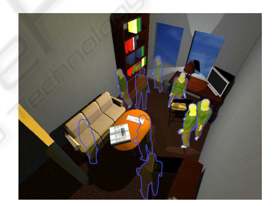
Figure 4: Using silhouettes to further enhance the character's visibility.

Silhouettes: One major concern when superimposing multiple positions of the character in the same image is that the character might not be optimally visible in a rather cluttered image showing multiple characters and the objects being present at the crime scene. Drawing the silhouettes of the character makes it stand out against the background of the crime scene and, hence, better visible, see Figure 4. The visual de-