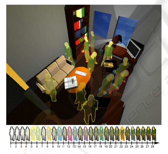
Figure 6: Combining the enhancement techniques in one image.

it comes to visualising events which are very close in time. Silhouettes could additionally be applied either to better differentiate between close positions or to directly encode time-lags. However, the latter does not hold for short changes in time. Figure 6 shows a combination of both techniques with an additional legend relating transparency and silhouette colours to the actual time values. This seems to be an adequate visualisation for a small number of significant events.