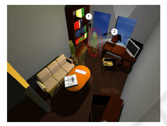
Figure 2: Transparency limits due to an accumulation of close character positions, see positions 1 and 2.