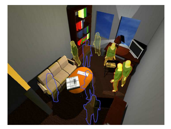
Figure 5: Using coloured silhouettes to additionally encode time. For instance, fast user movement is indicated by the blue silhouettes.

it comes to visualising events which are very close in time. Silhouettes could additionally be applied either to better differentiate between close positions or to directly encode time-lags. However, the latter does not hold for short changes in time. Figure 6 shows a combination of both techniques with an additional legend relating transparency and silhouette colours to the actual time values. This seems to be an adequate visualisation for a small number of significant events.