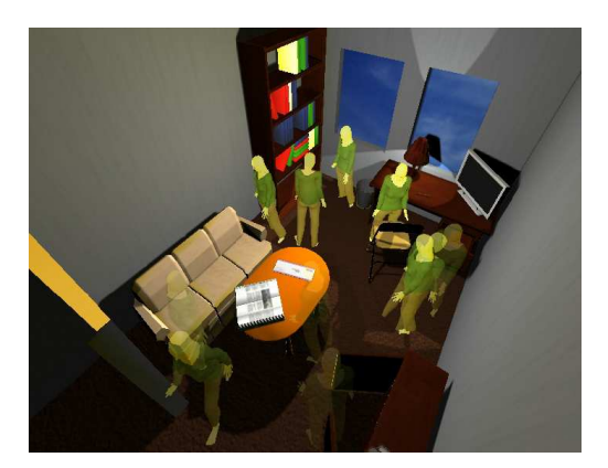
Figure 1: Encoding position over time by different transparency values.