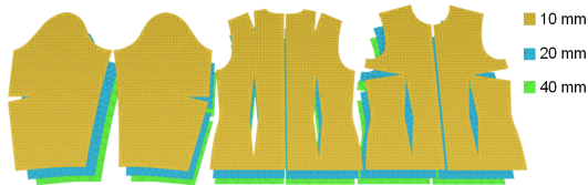
Figure 4: Multi-resolution of a shirt garments.

Multi-resolution methods are presented in many papers as (Li and Volkov, 2005), (Dave Hutchinson, 1996), but they are restricted to the case of simple triangular meshes to model cloth. The triangular mesh can be easily decomposed in several child triangles to obtain a new unified mesh. However, these methods cannot be applied in the case of our model (T. Le Thanh, 2005; Provot, 1995), where the connectivity of springs is more complex.