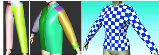
Figure 1: Input garment shape (left, middle) and output result using simulator (right).

The shape of the virtual garment is reconstructed from a set of 2D patterns; these patterns come from a CAD system or are created by a designer. In general, a mass/spring system is used to model the mechanical behavior of cloth. Any virtual cloth modeled by a mass/spring system can be applied to our method. The input to the technique presented in this paper is simply the output of the technique presented in (T. Le Thanh, 2005). Such an input is visualized on the left and middle part of figure 1. The garment is already positioned around the body but its energy is very high (the garment is highly deformed compared to the final result - See the right of figure 1). Therefore a long computation time is required to obtain an acceptable result (stable position of the garment).