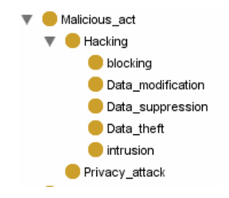
Figure 1: The class of malicious actions.

The class Malicious_Act depicts a classification for a sample of malicious actions: