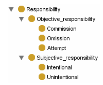
Figure 2: The class of responsibilities.

and subclasses defining these concepts are exclusives.