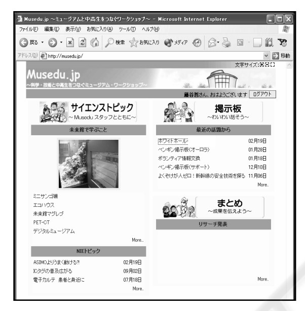
Figure 1: Musedu.jp: virtual learning community website.It consists of three parts: "Science Topics" for introduction and commentary of new technology trends; "Bulletin Board" for a place of on-line intensive studies building scientific knowledge together; "Space for Presentation" for making simple website.

This study mainly concerns improving the understanding of emerging science and technology through science museums. First, a group of volunteers was formed to interface with students. We held lectures and discussions to exchange opinions for the sake of those technical specialists with limited pedagogical experience. The science museum volunteers from specialized emerging technological and scientific fields formed the community that interfaced with high school students as scientists and technicians.