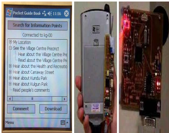
Figure 1: a) Menu Browser on the IPAQ – b) Pointer prototype – c) Tag prototype

The other method that a user may employ to access information from the IPSN is by way of a pointer (Figure 1b) and tag (Figure 1c) system also developed for the purposes of this scenario. This pointer-and-tag system allows the user to point to the specific information they require, without the need of connecting to a particular IPS and searching through a menu for the information they require. The pointer is attached to the MCD, and the user intuitively points this to the tag associated with the information they would like to view. The user’s experience of an information item once it is downloaded via Bluetooth is the same regardless of how the user selected it.