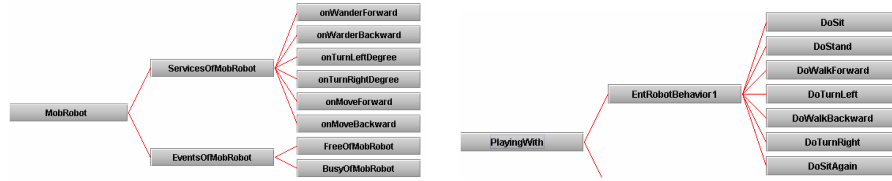
(a) Interface frame module for “MobRobot” (b) Policy frame module for “PlayingWith”

platform provides a central module, which acts as blackboard, knowledge processing brain, memory, and do the judgment, task planning and execution. Frames and their slots in SPAK are adopted to define the knowledge representation of coordination. Connecting with the root of the model are frames of “HumanRequests”, “Interfaces”, “Policies”, etc.