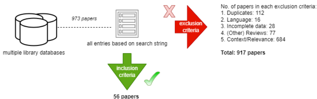
Figure 1: Filtering of academic literature based on selection process.