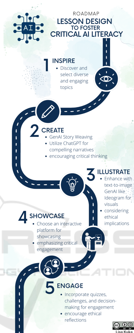
Figure 3: Roadmap: Lesson Design to Foster Critical AI Literacy.

The following description is designed for direct distribution to students, with the option to include the detailed task description if desired. While the task details are available, they are not obligatory to hand out by teachers, allowing for flexibility. This description, tailored for direct dissemination to students, embraces the flexibility to include a detailed task description, emphasizing the objective of engaging with Generative AI tools. Acknowledging the potential influence of vague instructions on creativity, recent research offers nuanced insights. Dove et al. (2017) suggest that constraints and ambiguity can positively support small-scale creativity. Simultaneously, Mascio et al.’s (2018) findings underscore the importance of the wording and placement of task instructions in shaping the novelty and workability of ideas. Levenson’s (2013) emphasis on task features, cognitive demands, emotions, and values aligns with the notion that these factors play pivotal roles in promoting creativity, especially in mathematical contexts. Nevertheless, Halpern’s (2010) cautionary note about a gap between the potential for enhancing creativity and actual practices in university classrooms adds a layer