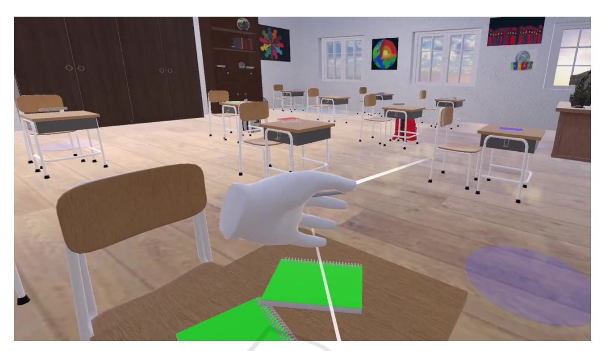
Figure 2: Gaming Stage, a classroom to interact with objects during the first minute of playing.

Words are identified as enemies and are spawned in random positions of the navmesh with a fixed delay.