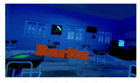
Figure 3: An insult reaching the player.

When a word reach a location closer than a threshold of two to the player an impact occur and a epical damage effect is perceived. When the number of impacts is above a threshold, the user is supposed to lose the game and is directed to a final scene where he or she can restart the experience or quit it. Figure 3: An insult reaching the player.