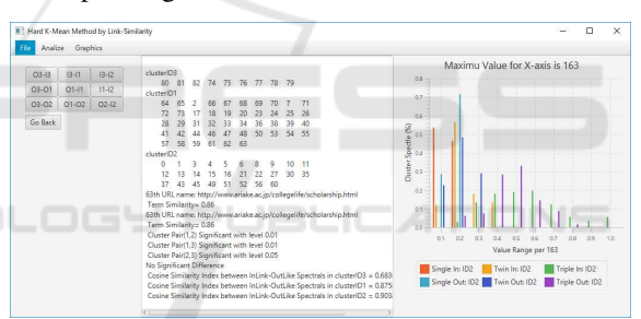
Figure 4: Spectrum Chart in the right Pane.

In the right pane of Figure 4, the spectrum charts corresponding to each cluster are shown.