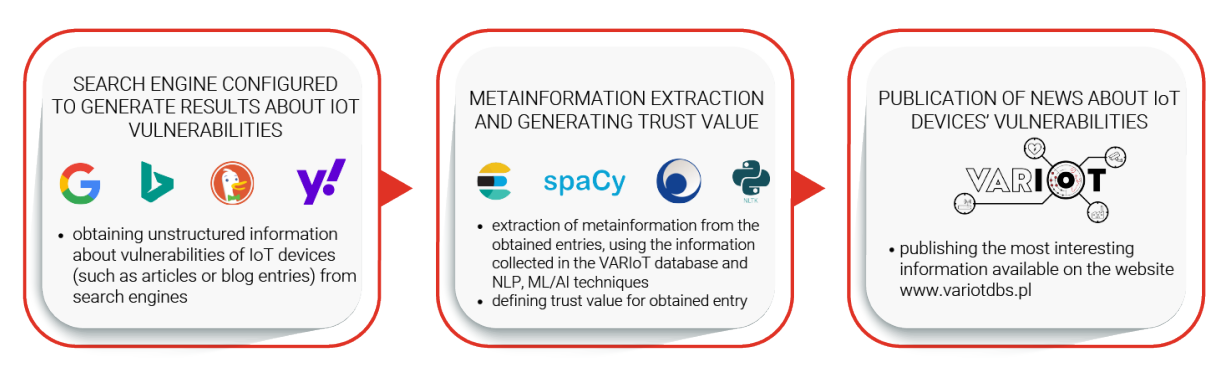
Figure 3: IoT vulnerability search engine.

The Exploit section allows you to view exploits that may pose a threat to IoT devices. Currently (as of April 5, 2022), it is in the testing phase, but by the time this article is published, it will have been refined and will work in a similar way to the vulnerability section.