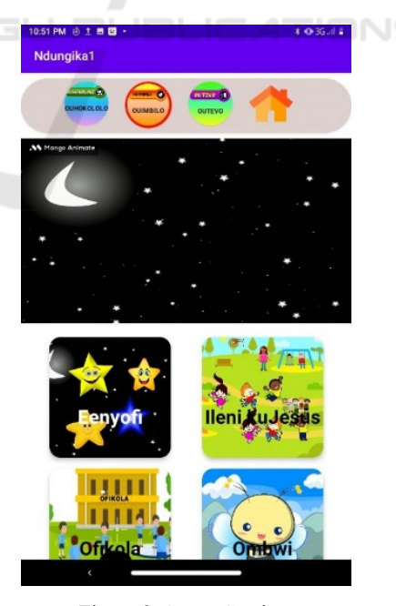
Figure 2: Songs Section.