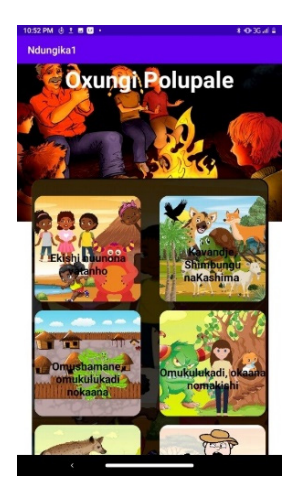
Figure 3: Stories Section.