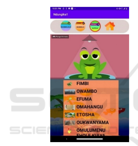
Figure 4: Poems Section.