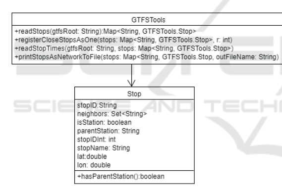
Figure 2: The UML class diagram of the network converter tool. The Stop class is an inner class of GTFSTools.

Providing an out of the box tool to do the extraction we have implemented a tool in Java that can process unzipped GTFS feeds and results a network as a .txt file described by the edges of the network. Namely in each line of the file an edge is listed by containing the starting and arriving stops separated by a comma.