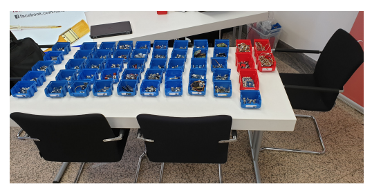
Figure 1: Selection of sensors for the craftsmen.

The aim of implementing the prototypes together with the craftsmen was to show them, using concrete examples that are relevant to them and that were identified by themselves, (i) which sensors are available, (ii) what they can measure and how they record data, (iii) how the data can then be sent to a backend and can be stored and processed accordingly. For that,