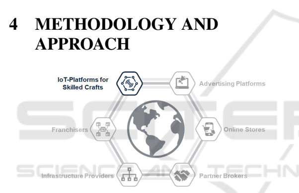
Figure 3: Adding IoT Platforms as missing Platform for the Skilled Crafts.

The hackathons have proven to be a useful tool for introducing craftsmen to IoT topics. In particular, the great potential of IoT for the skilled crafts could be experienced by the participants, but it also became obvious that the implementation of own IoT use cases cannot be achieved by the craftsmen themselves. The support of developers and scientists has always been needed.