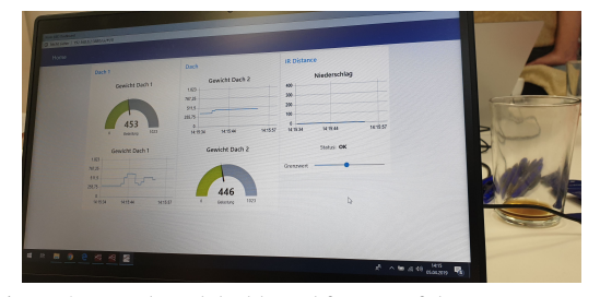
Figure 2: Developed dashboard for one of the IoT use cases.

we provided a large set of different sensors to the craftsmen (cf. Figure 1). After selecting the relevant sensors for their use cases, the craftsmen had to connect the sensors to a Raspberry Pi and the data were recorded using NodeRED<sup>16</sup>. From there, the data was transmitted via an MQTT Broker to a cloud instance on which we then developed visualizations and business logic for the identified use cases (cf. Figure 2). In this way, the craftsmen were able to understand exactly what was happening, how the data was transmitted and how it could then be processed. However, it would not have been possible for the craftsmen to implement the prototypes without the help of the advisors.