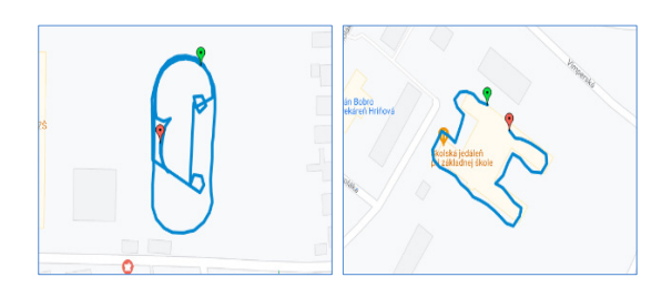
Figure 4: Drawings aligned to objects (Athletic smiley, Letter H).