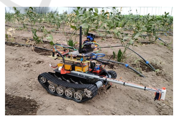
Figure 1: A robot working in the greenhouse.

Specific Scenario: The IoT system developed is an autonomous robot working in greenhouses acquiring data from environmental conditions. Therefore, the sensors used are SCD30 for temperature, humidity, and temperature. In addition, the VEML6075 is used to measure levels of UV rays. Also, it is necessary to acquire data from motors to get information about their velocity and gyration. Fig. 1 shows the system working on the greenhouse.