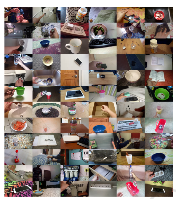
Figure 2: A small sample of the proposed OSDD dataset.

is state-dependent. For example, in order for a glass to be filled without an overflow its filled state must be recognized or even predicted on time. Actually, in many cases, miss-classifying the object state could be equally or even more detrimental as miss-classifying its category (e.g., recognizing a bottle as a jar vs. recognizing a filled bottle as an empty bottle). Second, inferring correctly the states of objects could facilitate significantly the recognition of actions. Conversely, the recognition of an action can provide cues about the states of objects which were affected by the action. SD is also relevant to another active and important research area, that of object affordances recognition. The inference of object affordances depends critically on their current state. For example, many different kinds of objects<sup>1</sup> could be used for carrying liquids, provided that they are empty. In this case, inferring the state of the candidate container is more important that recognizing its class.