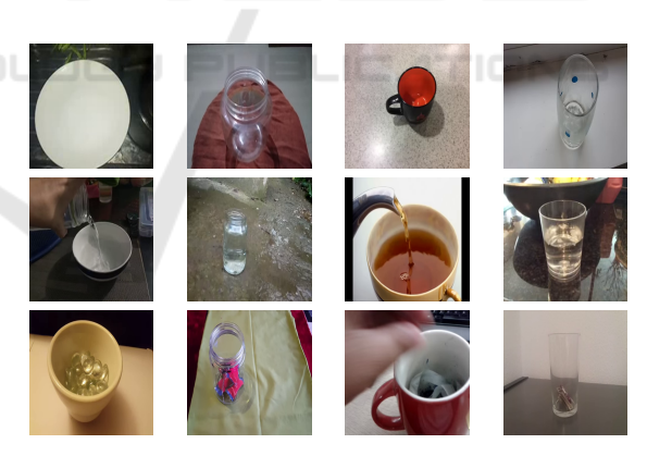
Figure 1: Each row contains objects of the same state and each column contains objects of the same class. The variance of visual appearance is significantly greater for objects of the same state than for objects of the same category.

Apart from being a challenging task bearing some unique characteristics, object state detection (SD) is a key visual competence, as the successful interaction of an agent with its environment depends critically on its ability to solve this problem. SD is also closely related to other important computer vision and AI problems, such as action recognition and planning. Surprisingly, the amount of research on this subject re-