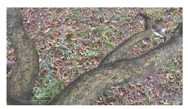
Figure 3: Part of the tree root and blue water particles.

so the user can watch it more than one time. The animation starts when the rain begins to fall. Because in nature there are trees of different sizes, an adjustable size of the roots is necessary. We provide functionality for scaling to the model and the users can control the size incrementally with voice commands ("bigger"/"smaller").