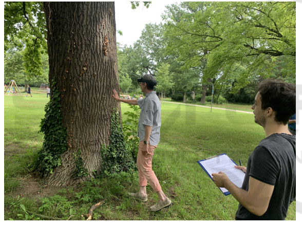
Figure 1: By touching the real tree virtual leaves fall to the ground.

We used a draggable virtual stem to decide on which real tree to show the visualization. Here, the first idea was to use the surface magnetism solver (Microsoft, 2021d) to position the visualization. This would be a good choice for displaying objects on walls or floors as they appear automatically and "stick" to the walls. In the context of nature most objects do not have flat and big surfaces and therefore the surface magnetism does not work well. We decided to let the virtual stem be manually and thus more precisely positioned by an advanced user, which could be a teacher in educational context or an organizer of nature educational excursions. After positioning the virtual tree on the desired real one, the teacher confirms and the virtual stem "disappears". Technically this happens by using a shader that renders the stem invisible. The virtual tree is not draggable anymore but can be used to show virtual leaves on the ground. The user (a student, in the educational context) can now touch the tree and virtual leaves fall to the ground.