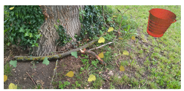
Figure 2: Different types of leaves lie on the ground and can be collected in a bucket.

a ray, coming from the hand is used to select the leaf and then with the grab gesture known from the direct interaction the object can be moved. The exact scenario for the user tests is explained in detail in section 4.1.