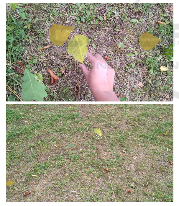
Figure 4: The two investigated interaction techniques. Top: Direct manipulation with hands (near). Down: Point and commit with hands (far).

tree and had to collect five oak leaves and put them in a virtual bucket next to the tree as fast as possible. They had to choose from three leaf types - birch, oak and maple. In a preparatory stage, the users tried the different techniques, which had been explained to them before the test started. The first task was to collect the virtual oak leaves using the direct manipulation with hands (near interaction, see figure 4 top). The second task was to collect the leaves using far interaction (See figure 4 down). The different times it took users to complete the tasks were saved. Collecting of virtual leaves was selected as a task to compare the different interaction possibilities. The overall scenario described so far was chosen for two reasons. First, an AR outdoor study (Lilligreen et al., 2021) focused on depth perception found that context plays an important role – e.g., users rejected a visualization of a grid over a virtual hole to enhance depth perception in the forest because a grid is not what would be expected in nature. Leaves are part of the forest and collecting them during a walk is not an atypical action. Second, a task to collect only a specific type of tree leaves can be used in a learning scenario.