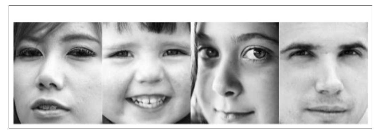
Figure 1: Diversity in faces across the different regions (AFLW Dataset).

finally used to jointly predict the specific social attribute score on a scale ranging from zero to one.