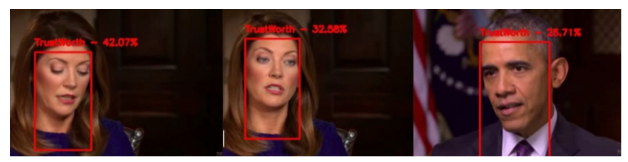
Figure 3: Video Frames from the processed video feed indicating detected faces and their attribute scores (trustworthiness) in real-time.

with Keras (Chollet et al., 2015) on a NVIDIA Tesla K80 GPU.