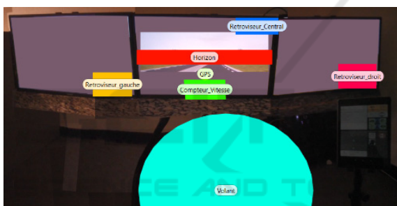
Figure 2: Spatial representation of the areas of interest on the reference image of the participants' full visual field.

The fixations in the far forward area represent an attention disengagement fixation area: 1 AOI - "Horizon".