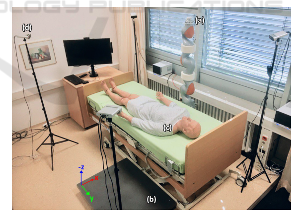
Figure 1: Setup for the support of nursing care bed activities using a bedside mounted KUKA LBR iiwa 7 R800 (a), an AMTI AccuPower portable force measuring platform (b), a rescue dummy functioning as a patient simulator with a weight of 80 kg (c) and a multi depth camera system (d).

Common physical support tools are only of limited help in this regard. For instance, the time consuming usage of patient lifters is usually limited to the transfer to or into the bed and thus does not actively promote the patient's mobility. A further possibility of relief is the augmentation of the nursing staff's