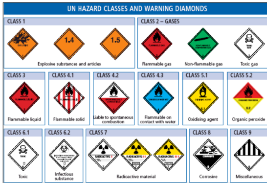
Figure 3: Dangerous Goods Classification.

Except for general container, other types of container are under different special treatment and conditions. As for dangerous goods, they are articles or substances which capable of posing a risk to health, safety, property, or the environment when transported by air. To ensure the safe transport of dangerous goods by air, requirements are set in place for both shippers, freight forwarders and air operators. These Classes and divisions have characteristic danger labels (aka warning diamonds) as shown in Figure 3.