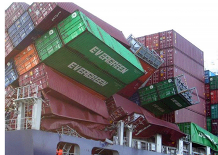
Figure 1: Unsuccessful stowage plan causes severe accident.

increase of container amount under traditional algorithm, which makes it very hard to implement in real business condition.