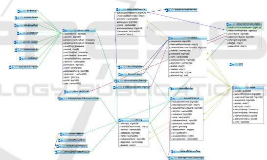
Figure 3: Sketch of the core components of the SOS Data Model.

The data acquisition task is performed via a simple Python script which uses a library to handle the thermal sensor via the 1-wire MicroLAN (one, ). The code is reported in Figure 2. This script is meant to be adapted to the actual sensor or sensors accessible from the remote terminal as long as it returns a value as OUTPUT. We do not give more details on how to use different sensors or IoT devices to retrive sensor data and any further customisation is left to the user. Anyway, it is straight forward to adapt this script to many existing sensors as they come with Python support and, often, Raspberry PI support at the system level.