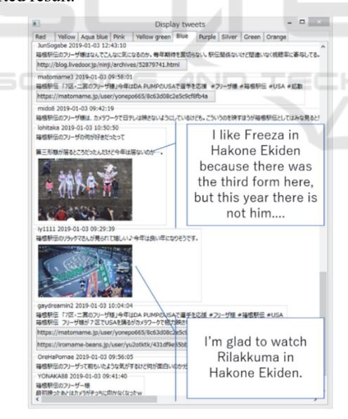
Figure 2: Displaying individual tweets (related to the blue cluster in Figure 1 and sorted in the order of favorites).

Our system displays individual tweets to allow its user to actually read and see them. It is sometimes difficult to understand topics from legends because tweets in a cluster share few words or because they mainly contain photos instead of words. The system lists tweets in each cluster together and sorts them from the newest to the oldest, in the descending order of favorites, or in the descending order of attached photos. As shown in Figure 2, the system displays tweets in the same cluster in line as Twitter's standard display method does. The system also allows its user to switch among clusters by selecting tabs. For each tweet, the system shows its user name, post time, text, photos, and links to URLs. The system first displays the ten highest tweets in the sorted result.