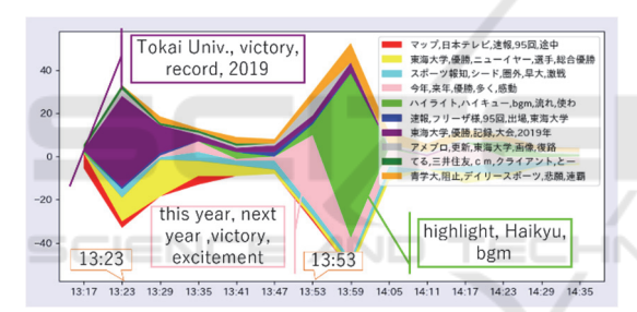
Figure 3: Zoom in the time series of Figure 1.

period when runners reached the goal. We zoom in and change the number of division of this period. Figure 3 shows this result, where the color of each cluster is the same as in Figure 1, but the legends are regenerated from the document that is composed of the tweets posted during this period. In Figure 1, the clusters that correspond to purple, yellow-green, and pink increased during this period. We can read the following from the legends of these clusters: the purple cluster indicates that Tokai University became a champion; the yellowgreen cluster indicates the highlight of the race; the pink cluster includes words such as this year and the next year. By zooming in this period as shown in Figure 3, the shift of major topics becomes visible. Tweets about the purple cluster increased rapidly in 13:23. Around this time, the first and the second team reached the goal on the backward path. These tweets increased around this time because the champion of the whole race was determined. In individual tweets, the pink cluster indicates impressions of the race and expectations for the next year's race. Tweets about this cluster increased around 13:50, immediately after 13:48 when the lowest team reached the goal.