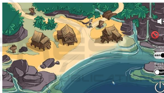
Figure 1: Screenshot of the Stranded home screen. By clicking on one of the cabins, the user goes to the tele-rehabilitation portal.

targeted health goals of the older adult. ‘Stranded’ is a game-based eHealth application that aims to engage the older adult on the long term by using gaming technologies. To the user, this game-based application can be seen as an alternative interface for the original eHealth application (called tele-rehabilitation). The intended target group for the application is aged 65-75 years, with sufficient computer literacy to independently use a mobile device or pc and with an interest in digital games. In the design process, game design and the selection of game elements were fitted to the specific preferences and characteristics of the intended target group. This resulted in a set of game design guidelines (as described in de Vette et al., submitted) for older adults, with the following characteristics: moderate—to-high novelty (e.g. story line, enabling exploration), moderate-to-high dedication (e.g. enabling achievement, learning and mastery), low Discord and Threat (e.g. relaxed atmosphere, not triggering negative emotions) and low Social (i.e. solo player).