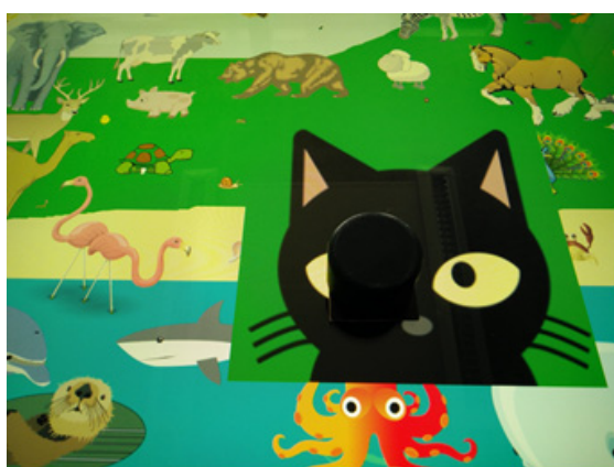
Figure 1: Magnification demonstration.

For the first brainstorming, we presented the teachers a simple demonstration with a virtual magnifying window as a way to fuel the discussions. This magnifying window enabled enlarging the underlying