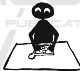
Figure 3: The content inside of the frame is directly adapted.

While the interviewees proposed diverse solutions (split-screen, taking turns on being the main user of the screen, making the tap gesture a magnifying interaction by default...), the one that reached the best acceptance was about using a tangible frame. It answered most of their recommendations. It is flat thus not obtrusive. Its tangible borders make it a good way to separate the adapted content (inside of the frame) from the original one (outside of the frame). It also allows for direct and clear interaction with the tabletop, since the adapted content is linked with the frame position.