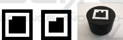
Figure 4: Fiducial markers and tangible object.

The Interactive Tabletop we use for our work is a Multitaction optical table. It uses infrared sensitive video-cameras to perform touch and object detection. Object recognition is achieved through the use of squared black and white tags pasted on the bottom of the objects (see Figure 4) which are in direct contact with the tabletop's surface. The position of such objects and fingers is then transmitted to the tabletop's software applications thanks to a communication protocol named TUIO (Kaltenbrunner, 2009).