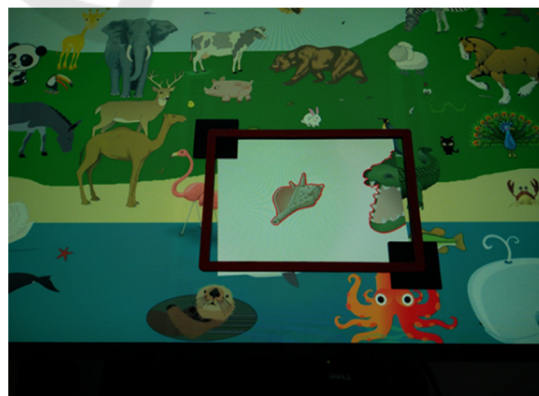
Figure 6: Tangible frame in application.

To stick with the idea of providing such an accessibility tool for different kinds of educative games, we used Unity3D (Unity Technologies, 2017) to develop our demonstration. Unity is a broadly used game engine which allows many kind of realisations such as interactive demonstrations, commercial video games or educative games.