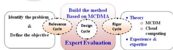
Figure1: Methodology adopted from (Hevner et al., 2004).

As the output of this research is an artifact that is a method, design science approach is used to design this method. Design science research is well suited for a research that needs to create practical IT artifacts such as construct, model, method, or an instantiation (Hevner et al., 2004). Design science research project must contain three clearly identifiable and closely related cycles (relevance, design and rigor) of activities (Hevner, 2007). Hence, our research method was structured based on these three-cycles of activities as shown in figure 1.