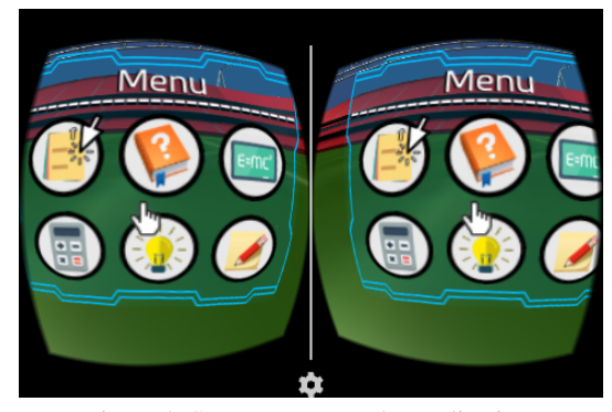
Figure 4: System menu on the application.

Once selected the subject to study, a screen is presented in which a voice will guide the user with the actions to be performed to solve the activity in the virtual laboratory is shown in Figure 4.