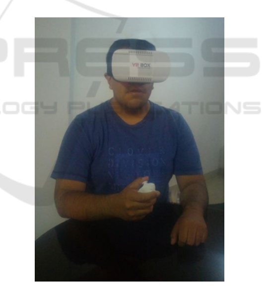
Figure 3: Using the system.

Before beginning to use the application the user must place the mobile device inside the VR Box and start the application; when the application starts is displayed a splash screen, in which the user must select the Movement in Physics that they want to study.