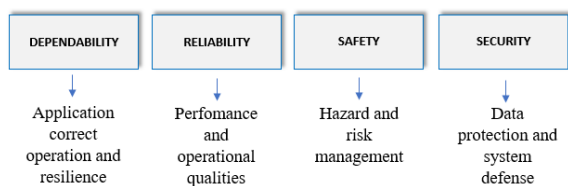
Figure 2: Quality attributes.

We based our choice on the available standards and attributes presented by (Barbacci et al., 1995), (Sommerville, 2004), (Atoum and Bong, 2015). Therefore, the considered quality attributes are: