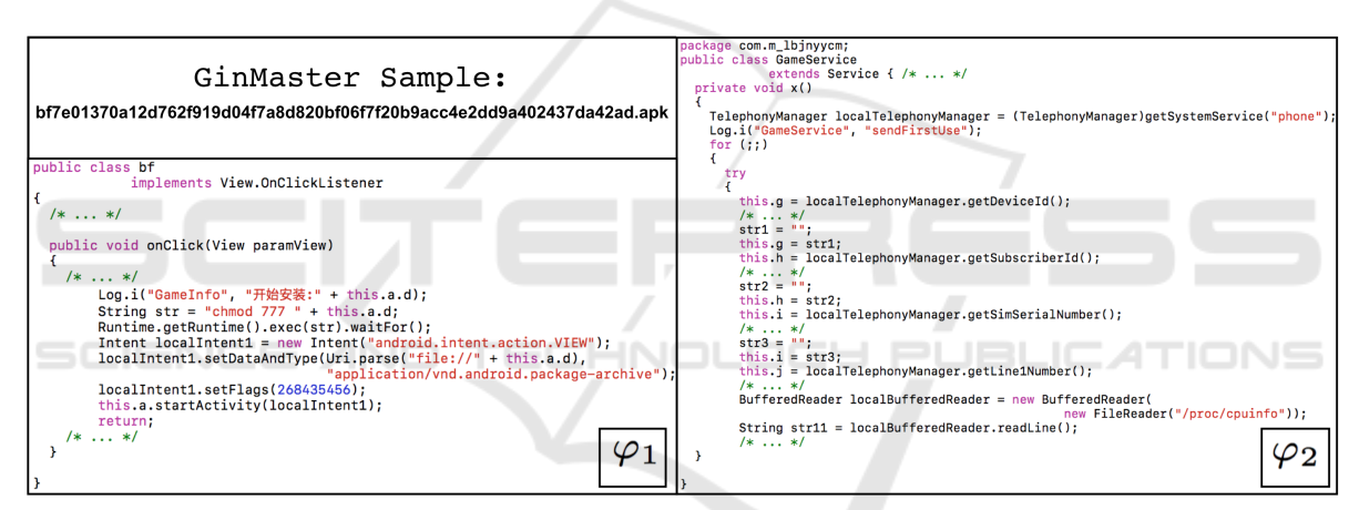
Figure 2: Code Snippet Related to Logic Formulae \varphi_1 and \varphi_2 .

represented by this Process object has terminated. This method returns immediately if the subprocess has already terminated. If the subprocess has not yet terminated, the calling thread will be blocked until the subprocess exits. In this case the subprocess is represented by the execution of the script to root the device;