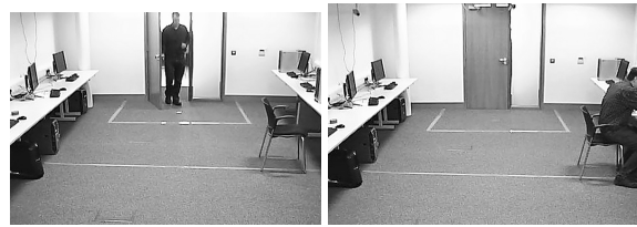
Figure 2: A staff member (i) entering a computer room and (ii) sitting at a computer.

room, walk towards a computer and dust the desk. A violation will occur if the behaviour of that staff member does not match that expected of their job. For example, given Figure 2 (ii) it shows a staff member sitting at the computer. This behaviour is normal for a technician but a violation for a cleaner.