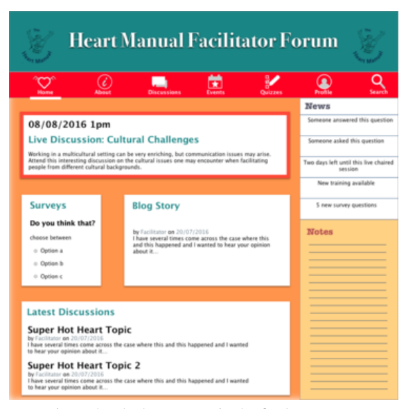
Figure 3: The home page in the final prototype.

A hi-fi web-based prototype was developed by adapting the first prototype given the feedback gathered. It was presented on a browser and made from linked screens to generate a feel of the interactions that would take place (see Figure 3). Its main difference to the first prototype was that users could interact with the system and see its dynamics in operation. The pro-