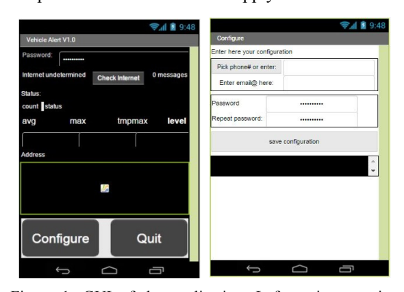
Figure 1: GUI of the application. Left: main operation screen (dark for stealthyness). Right: configuration screen.

The architecture of the alert system ICaBrAS is simple: once started, the app continuously captures data from the accelerometers and processes these data so that resulting values can be used to classify the detected motion activity. The data capture works as fast as the phone can capture and process the acceleration data. This means it draws significant battery current; therefore it is advisable to connect the power to the vehicle 12V supply.