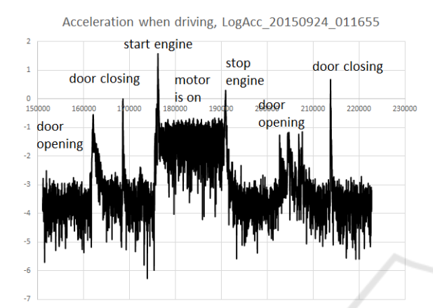
Figure 4: Log acceleration values during different phases of vehicle operation.

In Figure 4 the log acceleration is shown during several phases of driving. The first peak is when opening the door, then shutting it. At time 176,000 the motor is started, and then a constant acc noise level between -1 and -3 is recorded, which is clearly above the acc noise level for no motion. At time 191,000 the motor is switched off again, followed by some commotion which includes opening the door then shutting the door at 213,000. The time units are milliseconds.