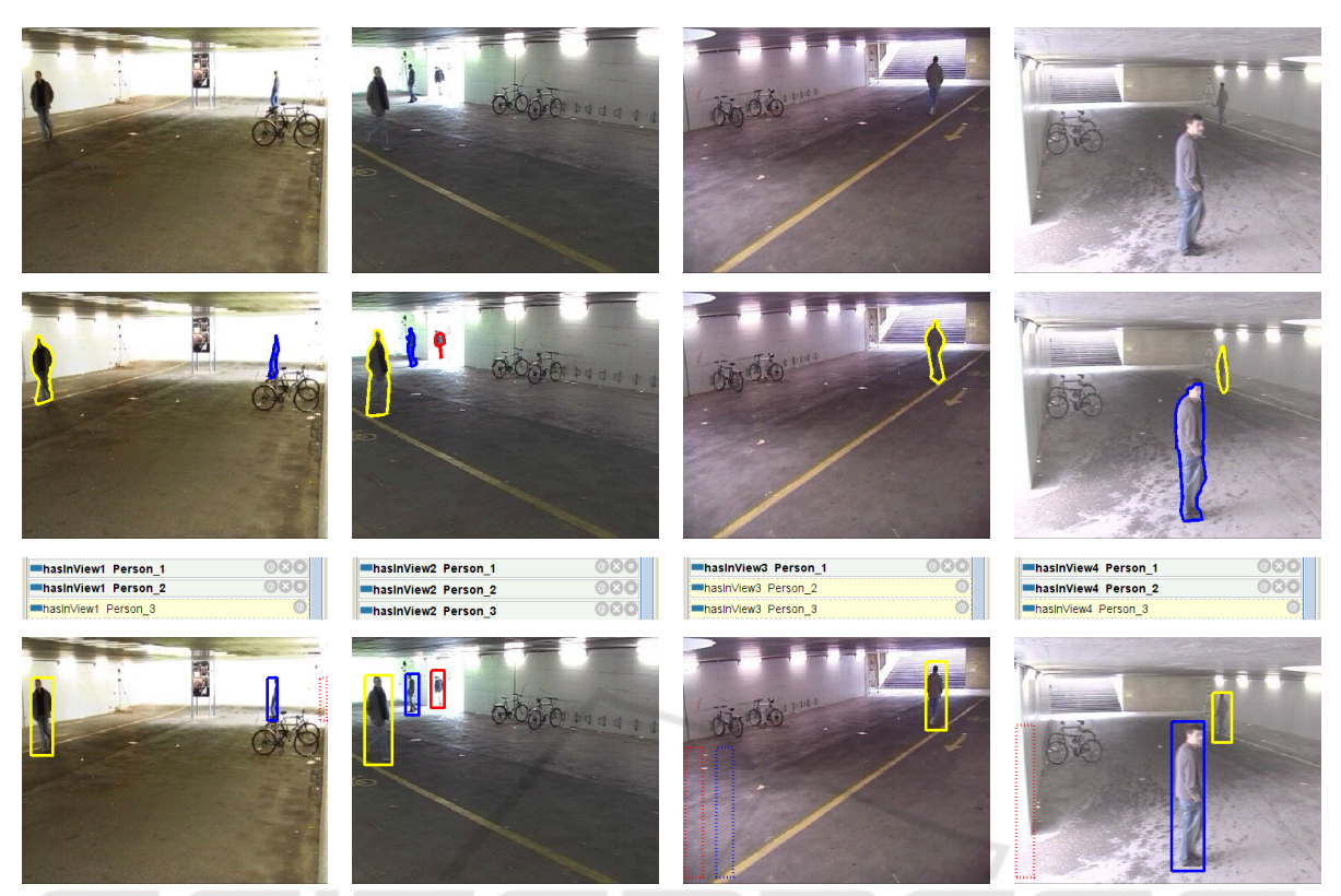
Figure 4: Examples of results obtained with our approach for a scene captured by four synchronized cameras with overlapping field of views. First column: view 1; Second column: view 2; Third column: view 3; Fourth column: view 4. First row: step 1 - raw data images. Second row: step 3 - visible persons detected in each of the camera views (e.g. Person 1 by yellow active contour; Person 2 by blue active contour; Person 3 by red active contour). Third row: step 6 - snippet of the automatically generated description for each view (extracted knowledge in blue, inducted knowledge in yellow). Fourth row: step 7 - detected persons in all views (bounding boxes), including the hidden persons (dotted bounding boxes). Best viewed in color.

ject Detection Precision (MODP) rates of our method against the rates achieved by (Fleuret et al., 2008) and (Berclaz et al., 2011), while in Table 2, we have displayed the Multiple Object Tracking Accuracy (MOTA) and Multiple Object Tracking Precision (MOTP) scores of our method against the rate obtained by (Berclaz et al., 2011).