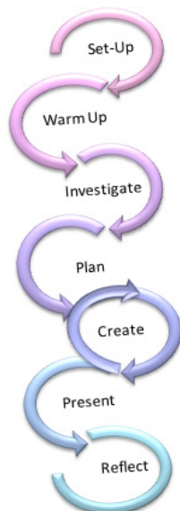
Figure 1: The Bridge21 Activity Model.

Bridge21 ( www.bridge21.ie ) is a model of collaborative, project-based learning that has been developed at the authors' institution (Lawlor et al., 2010; Lawlor et al., 2015). Initially established in 2007 as part of an outreach programme, the Bridge21 model has been developed throughout the intervening years and is currently being trialled in a number post-primary schools as part of a systemic process of reform of the Irish education system (Conneely et al., 2015; Department of Education and Skills, 2012; Lawlor et al., 2015). The Bridge21 activity model is inspired by the concept of Design Thinking (Brown, 2008), and brings together many of the elements of