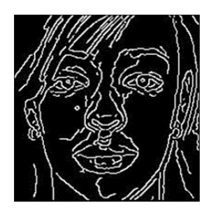
Figure 2: The example of canny filter applied.

Design Efficient Technologies for Context Image Analysis in Dialog HCI Using Self-Configuring Novelty Search Genetic Algorithm