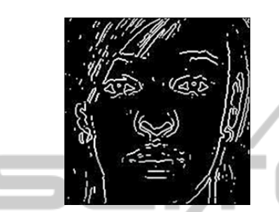
Figure 3: The example of zerocross filter applied.

A new image, obtained after a filter is applied forms new data in the training set. There the smallest size of the training set is in the case of no filter being used, the largest one is in the case of all filters being applied.