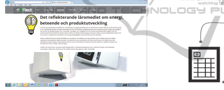
Figure 3: Front page of r(e)flect website (under development).

All material included in the box, besides the visualization tool, can be downloaded from the website. This makes r(e)flect widely available to Swedish teachers. The website also provides instructional videos for teachers and engaging informational videos for the students. Throughout the website teachers can find hints, or how to sections, for how the material can be used and linked to the traditional classroom learning. The website is under development, but some screenshots from the current website are shown in Figure 3 and Figure 4.