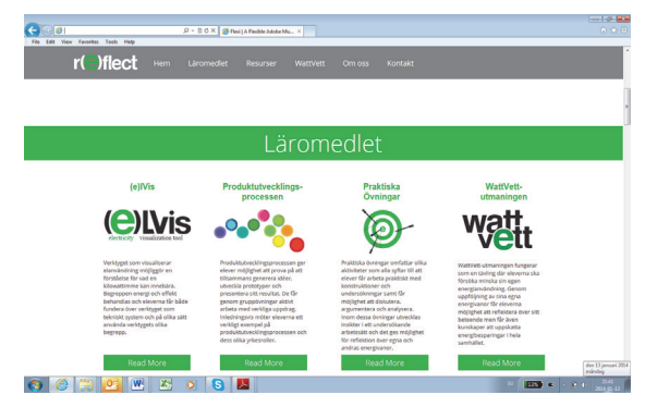
Figure 4: Website page showing the four parts of the teaching material (under development).