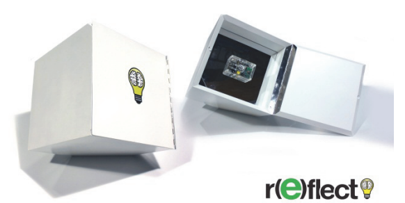
Figure 1: Parts of the teaching material r(e)flect are packaged in an interesting and excitingly designed box.

The teaching material consists of a website (see Section 3.3.) and a physical material, see Figure 1. The packaging has been given an interesting and exciting design to attract both students and teachers.