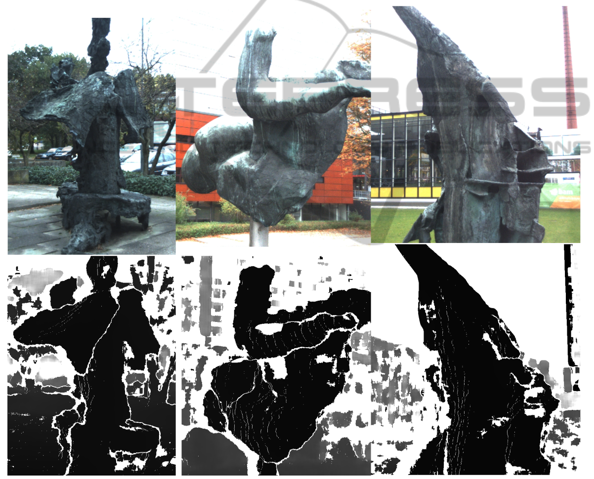
Figure 1: Snapshots of the modern art statues and their corresponding depth frame extracted from stereo data. The depth frames depict the closer depth information as darker points.

the surfaces with sufficient visual features that absorb or distract the IR projected patterns of the Kinect, the stereo camera provides more continuous and smooth depth data. This motivates a hybrid-sensing approach, where both the Kinect and stereo sensors are deployed in a single system setup, to increase reconstruction robustness of heterogeneous scenes.