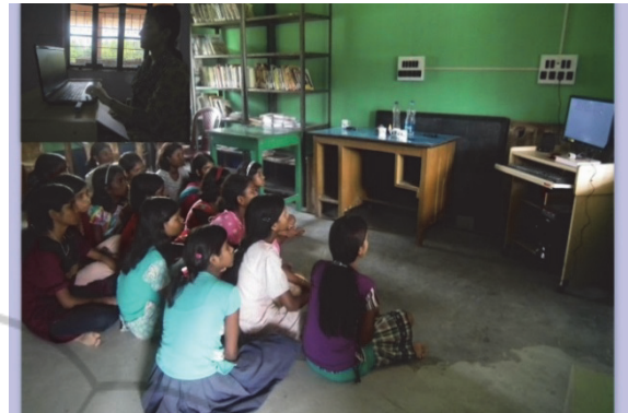
Figure 1: Children Being Taught Remotely (Inset: The Remote Instructor).

covering the topics taught via ICT, to gauge their interest, retention and possible improvement.