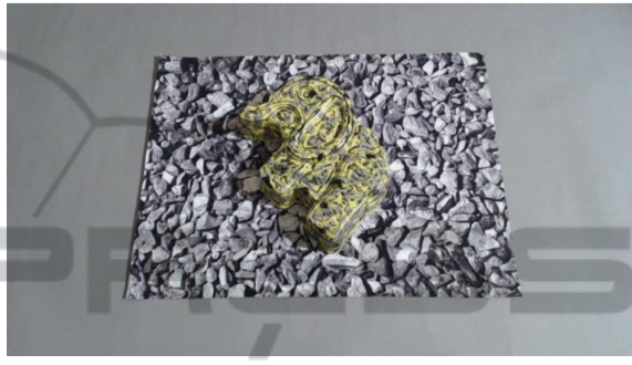
Figure 7: The two lighting conditions used in the first experiment. Top: The real object shown in ambient light. Bottom: The real object shown in spot light.

the effect of artefacts (noise and anti-aliasing) was evaluated, as a lack of it might make it possible to identify the virtual objects. Given both a spot and an ambient light setup, both low and high frequency shadows could be present in the scene (see Figure 7). The high frequency shadow was evaluated both as rendered in real-time and as pre-rendered (baked into a semi-transparent ground plane, so the underlay was visible). The low frequency shadows were always baked, since they were a product of global illumination given 1024 lights from the environmental map, approximating the real light distribution in the scene. The number of lights needed to shade the objects (2 to 16 lights) was also evaluated, which was always performed in real-time. The number of lights was suppose to determine how accurate the light distribution should be to in order to have a realistic shading on the objects. This is important since it is difficult to generate lights from the surrounding environment and the minimization of the light calculations could be beneficial. Moreover, the lack of highlights were also evaluated to assess the importance in AR solutions. This was achieved by displaying a specular object with and without specular highlights. Lastly, in order to confirm that model complexity is important and to see how important smooth silhouettes are in an AR context, the augmented objects were evaluated at three different polygon resolutions (see Figure 4).