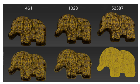
Figure 4: From left to right: The specular toy elephant in two low complexity versions, as well as the scanned original. Bottom row shows the same objects in wire frame. The polygon count is noted in the top.

Median cut divides the energy because the image is interpreted as areas of light. This approach is good for ambient light scenes, since each light radia-