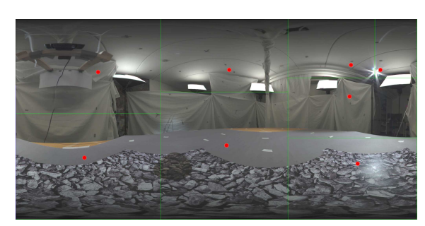
Figure 5: Example of how the generated lights (red dots) does not exactly align with the spot light in the upper right corner

tion from a given area of a surface is correctly represented. However, if a scene with a spot light is represented by a low number of lights, the generated position of the spot might not be exactly on the right latitude-longitude position (see example in Figure 5). This could influence the shading of the virtual objects. Therefore, the spotlight was masked out from the environment map and lights were generated from this modified map. The spot light was then manually added to the scene and the intensity was matched with the physical spot light.