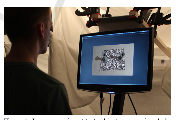
Figure 1: In one experiment test subjects assess virtual objects and compare them with real objects in an AR context. The scenes are rendered in real-time and artefacts of the camera, as well as the surrounding environment, are considered to integrate an object in the video-feed such that it is indistinguishable from a real object.

It is well recognized in computer graphics that parameters such as high model complexity, accurate highlights and both low frequency shadows (soft