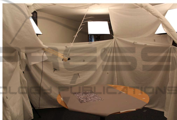
Figure 3: Top: An image of the setup. The test subjects are only able to watch the monitor and not the scene. Furthermore, they are able to rotate the metal arm on which the monitor is attached. Bottom: An image of the scene that the web-camera captures. Using a protruding stick the web-camera was positioned closer to the centre to be able to track the marker and to be able to see details in the objects.