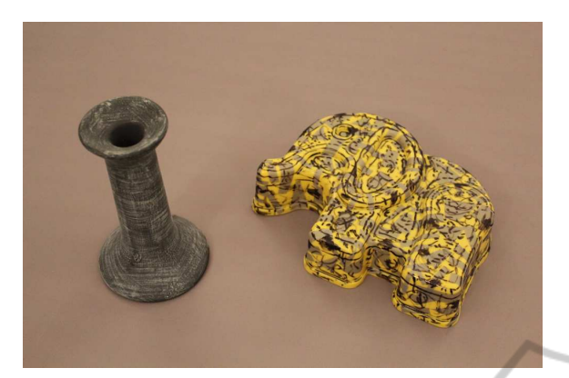
Figure 2: A photograph of the diffuse candlestick and the specular toy elephant chosen for the experiments.

minimization of computation usage is a requirement, hence a guidance for which quality of the different parameters to use would be beneficial and will be addressed in this work.