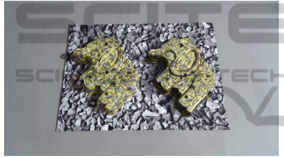
Figure 9: Image of the side by side comparison. Top: the real diffuse object to the left and the virtual diffuse object to the right. Bottom: the real specular object to the left and the virtual specular object to the right.