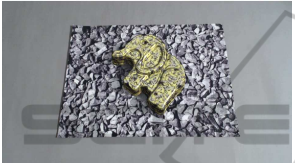
Figure 8: Top: Image from scene with specular elephant shaded by two lights and with pre-rendered shadows. Bottom: Image from scene with specular elephant shaded by 16 lights and with pre-rendered shadows.

used for evaluating the artefacts, the shadows and shading, the highlights and the geometry. The real object was used as control to verify the realism of the representation of the physical scene.