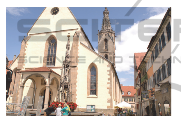
Figure 1: View at the west side of the dome from the market square.

The dome is located in the city's historical centre and is mostly surrounded by dense and irregular housing. The dome's tower rises from the dome's southern roof surface and reaches roughly 70m in height. The facades have a breadth of roughly 7,50m. Regardless of the used measurement technique, the rare possible terrestrial survey stations can mostly be found in the surrounding alleys and always suffer from either high distance or bad viewing angle or occlusion. Although there is a market square west of the dome, which provides a lot of space, the dome's entrance strongly occludes the view to the west side of the tower (Figure 1).