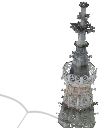
Figure 5: The six point clouds captured from the scaffold registered into a common coordinate system.

The undistorted images and their orientations were passed to our dense image matching software SURE (Rothermel et al., 2012), which incorporates a variant of semi-global matching, with a multi-view stereo triangulation step. The quality of the obtained point clouds has a large variety. As expected, the point clouds derived from the UAV images and those derived from the images collected from the scaffold (Figure 5), yield good to very good results. In contrast, the point clouds derived from terrestrial images yield a medium to bad quality. Nonetheless, redundancy and applying different filters to the point clouds delivered a sufficient overall data quality.