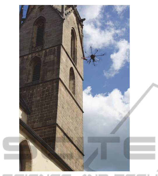
Figure 3: The octocopter collecting images at the southwest side of the tower.

and roughly 2400 very close images from the six uppermost scaffold levels.