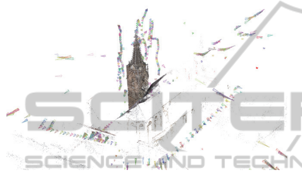
Figure 4: Sparse point cloud and stations of terrestrial and UAV images (VisualSFM output).

The connectivity of the images yields a network of relative orientations. While the described technique can be understood as an attempt to find optimal paths through this network, some recent developments aim at solving the issue as a global network optimization problem (Crandall et al., 2011). The basic idea is that a concatenation of relative transformations of a network cycle needs to result in an identity transformation. As we see a lot of potential in this approach, our future developments will aim in this direction.