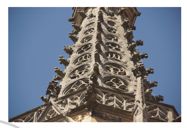
Figure 2: The tower helmet's rich details which should be collected from an elevated position.

As indicated before, dense image matching was to be used for as many parts of the tower as possible. The orientation of the images has been computed without any a priori information by means of structure-from-motion algorithms. To guarantee high coverage and quality of the derived point clouds, several aspects need to be taken into account. First, the image data set needs to provide enough overlap between the images to enable a stable orientation of the camera stations. Here usually a minimum of 60% is chosen. Second, this overlap needs also to fit the requirements of dense image matching. Here a higher overlap and hence greater similarity of the images is preferable. Of course, this results in a trade-off between matching completeness and triangulation accuracy, which gets worse for smaller intersection angles. We usually try to provide an overlap of 80%, which is a good compromise. Additionally, we make use of the given redundancy by applying multi-view-stereo triangulation to our data sets.