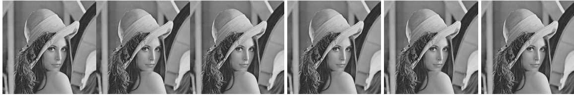
Figure 3: Left to Right: Original 'Lenna' image; Reconstructed image at quantized level 2; Reconstructed image at quantized level 4; Reconstructed image at quantized level 6; Reconstructed image at quantized level 8; Reconstructed image at quantized level 10. DB9 wavelets are used in all forward and inverse wavelet transforms.

of each horizontal, vertical and diagonal components, leaving approximation coefficients unchanged. The algorithm is based on the fact that a number of distributions tends toward a delta function in the limit of vanishing variance. In the following we systematically outline the algorithm.