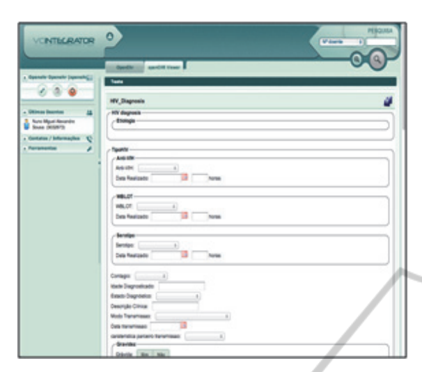
Figure 2: Arquetype template result.

of the biggest challenges is in the construction of the Graphical Interface that better reflects the applications needs from the defined templates.