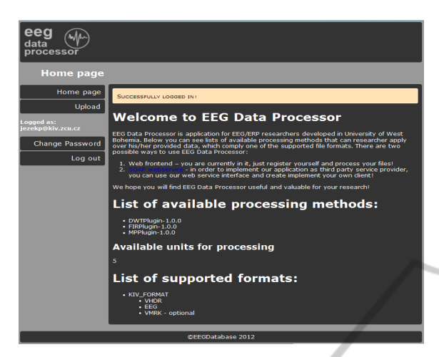
Figure 2: Web Interface Overview.