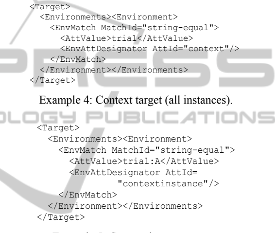
Example 5: Context instance target.

Example 5 gives the XACML code that needs to be specified to write a policy that targets a context instance trial A.