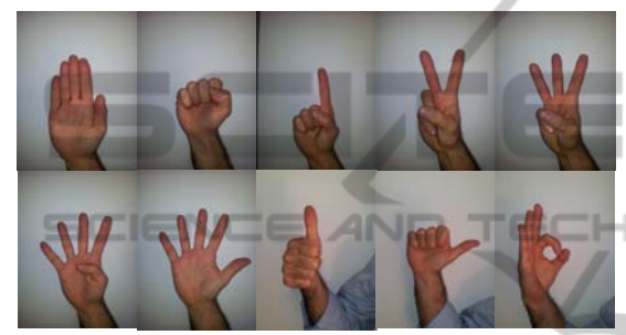
Figure 1: The defined gesture vocabulary.

The rest of the paper is as follows. First we review related work in section 2. Section 3 introduces the actual data pre-processing stage and feature extraction. Machine learning for the purpose of gesture classification is introduced in section 4. Datasets and experimental methodology are explained in section 5. Section 6 presents and discusses the results. Conclusions and future work are drawn in section 7.