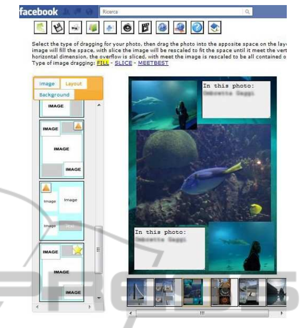
Figure 1: A screenshot of the authoring interface of SMIL PhotoShow . The text comments were automatically added on the base of the tags of the pictures.

Since the reason why many users do not create photo books is the time needed for this operation, we think that the slideshows can be a way to interest users to get a more sophisticated results: animated photo books differ from slideshows for the introduction of page layout and text comments. If the user like the animated presentations created with the slideshows, she/he can decide to spend more time to get a better result. The assumption that users prefer activities which give them a better result even if they require more time is supported also by the fact that photo books production is increasing better then the total number of printed pictures. As an example, CeWe Color produced about 4.3 million photo books in 2010 and this production has increased by 19% with respect