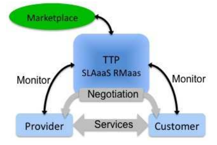
Figure 3: SLAaas decoupling from actual cloud service.

Decoupling these components from the actual cloud service provisioning as shown in Figure 3 has many advantages. First and foremost it accounts for a much needed separation of concern between service provisioning and the conditions under which the service is to be provided including monitoring. In doing so, SLA management could be considered as a Trusted Third Party (TTP) between SPs and customers in a similar way Certification Authorities are now well recognized in similar trust roles. Moreover, this may open a whole new area of expertise allowing SLAaaS providers to become new marketplaces for SLA management. One could even imagine industry or service type specific SLA providers with templates tuned to specific needs. For example, a company working in the finance industry and requiring a cloud storage service might be subject to specific rules with respect to where the data physically resides. In such a case, a Financial Services SLAaaS provider could be a good choice for the company and additional peace of mind when contracting cloud based storage services.